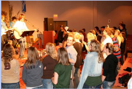
Crosswalk City-Wide Youth Rally.

Crosswalk is city-wide youth outreach ministry. I am involved with a network of youth pastors that have a desire to see the youth of Brockville reached for Christ. The events take days of planning and occur every two months and consist of games, worship and message.