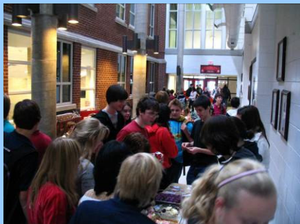
Happy Birthday Jesus cake and the BCI high school J-Cane give away.