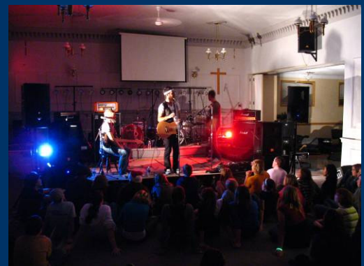
Last Minute Palooza outreach concert October 28 with the band "Atlantic"