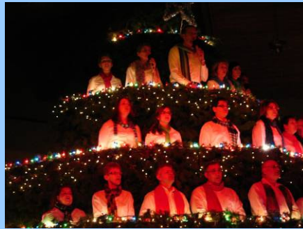
The cast of "The First Leon" and Niki in the Living Christmas Tree production.