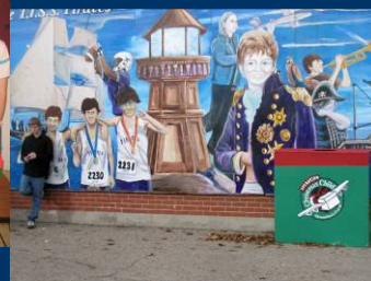
Samaritans Purse 2008.