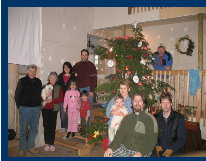
Houldcroft family cottage Christmas 2008.