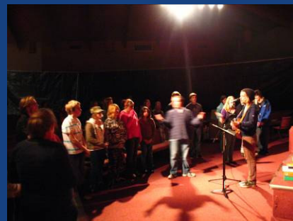
Quest worship time.