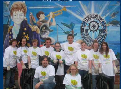
Being great "Stewards" on Earth Day @ TISS High School .