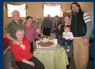
Canadian Council of Christian Charities & our commissioning cake ☺