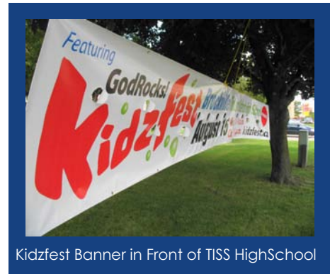
Kidzfest Banner in Front of TISS HighSchool

On August 15 Brockville hosted the Billy Graham Association's Kidzfest featuring God Rocks. The event was hosted by 12 different churches in the city of Brockville. Our committee started meeting almost 8 months before, in order to make sure this event was done with excellence and love. I was given the privilege to chair this committee which was a brand-new responsibility for me.