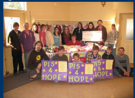
www.pjs4hope.com another great year to raise awareness for foster care & Interval house