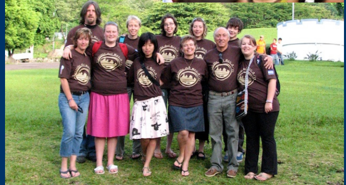
El Salvador 2010.